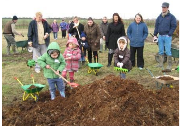
Little Windmills at Snakehall Farm

ties and an apple tree, while Manchetts of Burwell's Budgens store donated a wide range of fruits for the "guess the fruit game" the children played while eagerly waiting for their turn at digging.