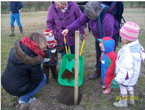
Little Windmills at Snakehall Farm