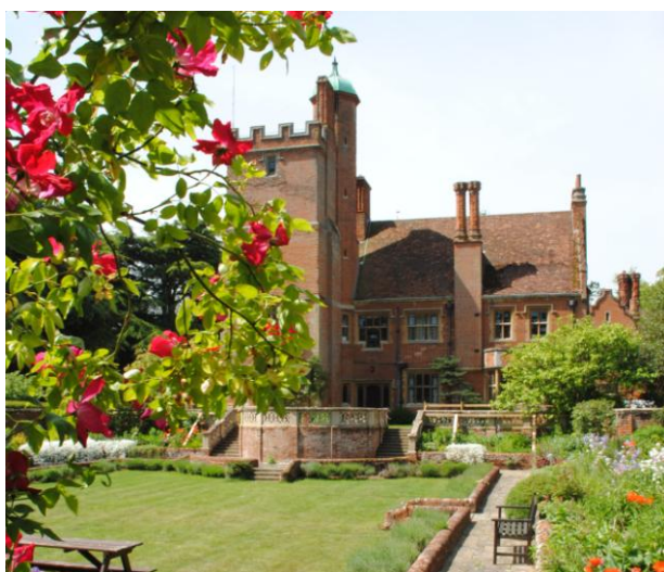
Lanwades Park, Kentford

Lanwades Park extends to approximately 120 acres including some 90 acres of paddocks and parkland. Within the park sits the Grade 2 Listed 'Tudorbethan' Lanwades Hall, which was completed in 1907 using the proceeds of a bet on a horserace nine years earlier!