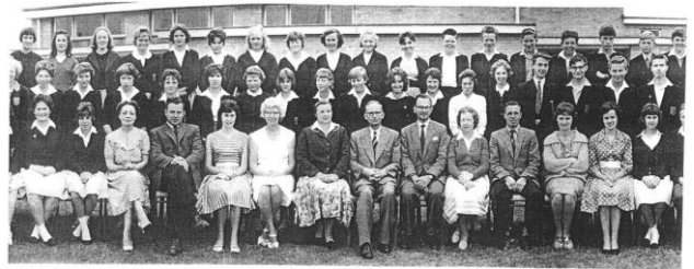
Burwell Secondary Modern School 1961