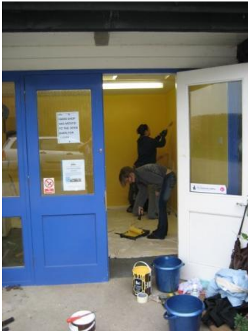
Spring Cleaning the Farm Shop