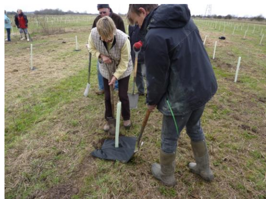
Longmeadow Community Woodland

Planting has begun on the Lode with Longmeadow Community Woodland on White Fen, near Lode. On a recent tree planting day volunteers managed to plant over 800 trees in a day. The woodland is one of five being created as part of the Planting Parishes initiative organised by East Cambs District Council and the Woodland Trust aimed at increasing tree cover in East Cambridgeshire by 5 - 10%.