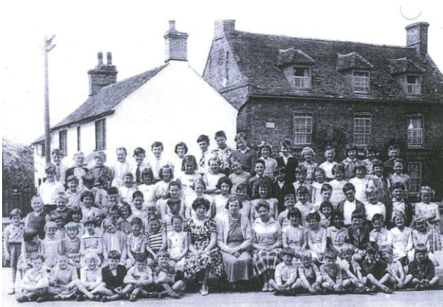
St Andrews, Burwell c. 1960

A I went to St Andrews, Burwell and Ness Road Primary School, Burwell. I was lucky as I moved school because I twice moved into a brand new school. It happened with my primary school and again with my secondary school, Burwell Village College. I must have coincided with a period of school building. The wall going into Burwell College is made of bricks saved from the old school.