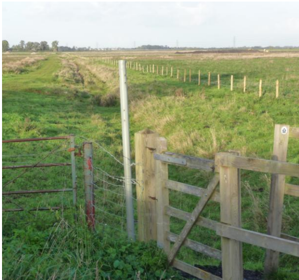
Missing Footpath Sign

How strange then, that the signs for the 'official' footpath across Burwell Fen have gone. The poles are still there but with no signs on top. Instead you find nearby the new signs pointing along The Lodes Way nice tarmac path to Wicken on the edge of the NT land.