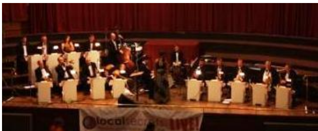
Harmony in Harlem

We enjoyed a great evening of toe tapping jazz thanks to the 17 piece orchestra, Harmony in Harlem, this March in the Cambridge Guild Hall. The charity event supported by Local Secrets is fast becoming THE annual event, this year raising a massive £2,241 in charitable donations to The Prospects Trust. The evening was given an extra air of excitement with a highly competitive auction. The lovely lots included two spring time lambing sessions, 4x4 Land Rover experience days, a shooting session at Long Acres Shooting Range, a behind the scenes tour of Fitzwilliam Museum by a chief technician and a Twilight tour of Clare College Gardens by their head gardener. Eversheds sponsored the raffle with a top prize of an Ipod and docking station. We send our thanks to all the sponsors, donors and dancers who made this event fantastic!