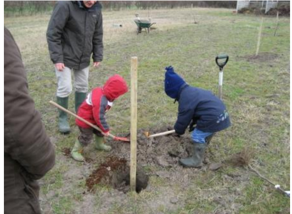
Little Windmills at Snakehall Farm

If you would like to know more about our Pre-school, please visit our website on: www.littlewindmills.co.uk or ring 07803 671200 during our session times to check availability. We still have vacancies for some of our sessions but more places will become available in September.